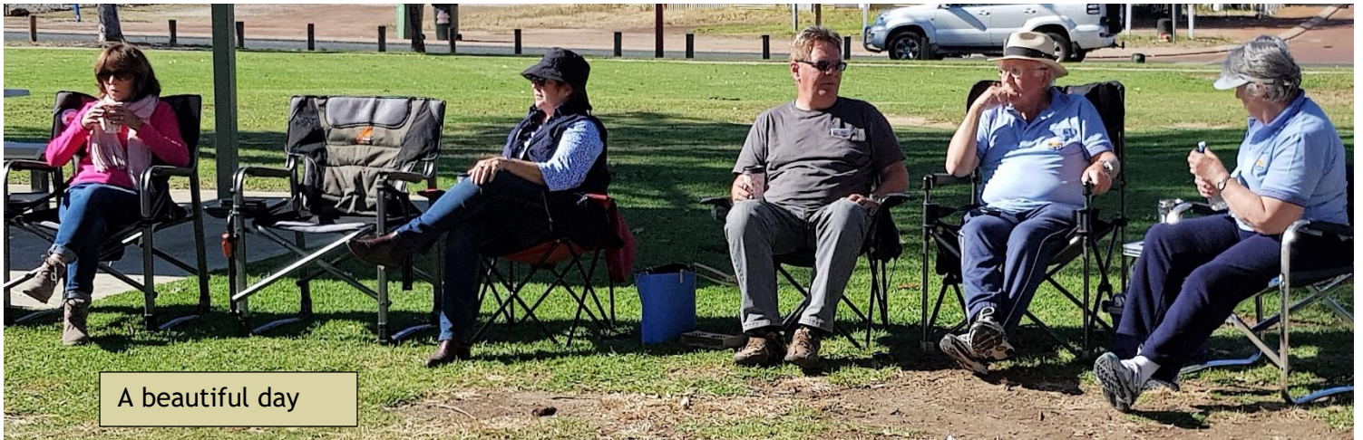
A beautiful day