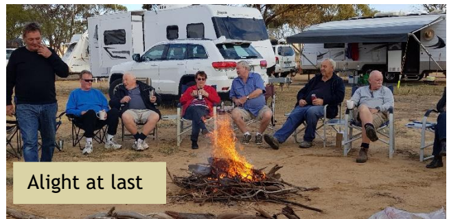
Alight at last