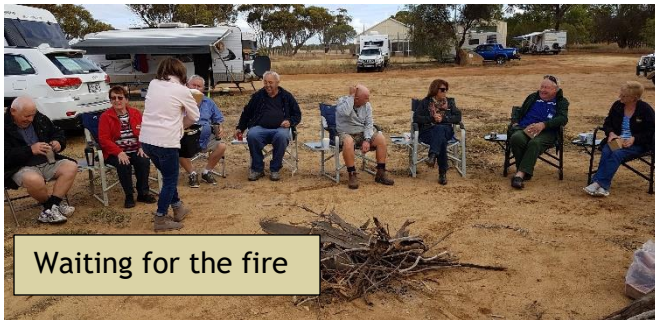
Waiting for the fire