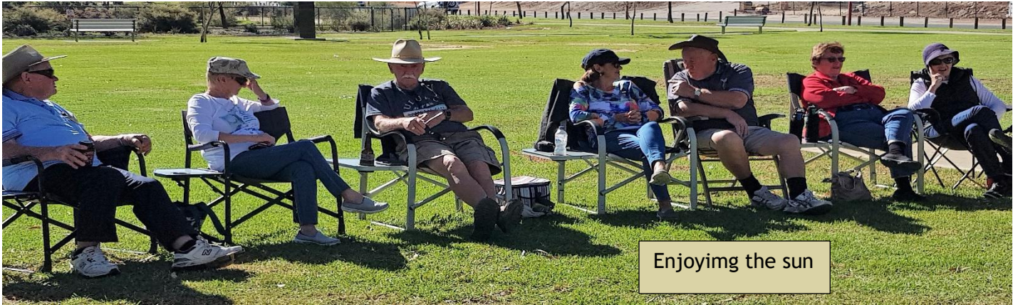
Enjoying the sun