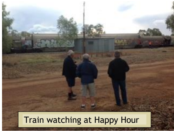
Train watching at Happy Hour