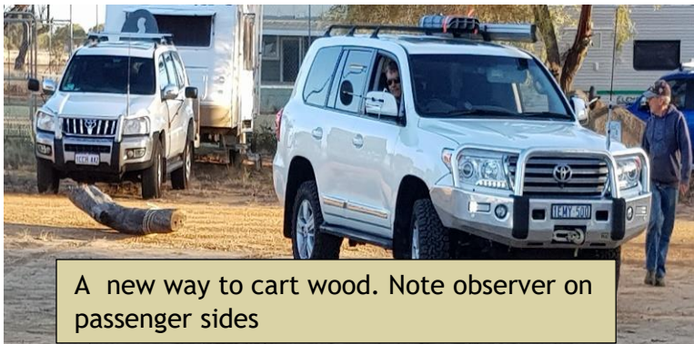
A new way to cart wood. Note observer on passenger sides