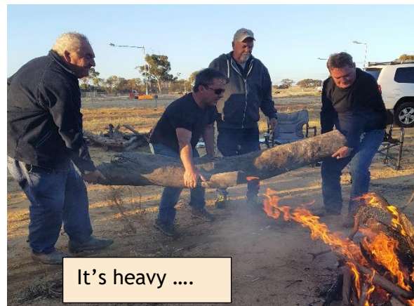
It's heavy ....